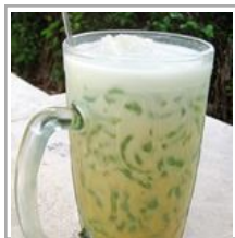
Watch: Alzheimer's Reversal "Cocktail" Changing Lives