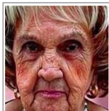
62-Yr-Old Wife Surprises Husband, Cries After Seeing Makeover