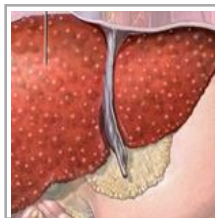
3 Signs You May Have a Fatty Liver [Watch]