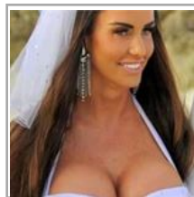
The Wedding Photographer Captured More Than Expected